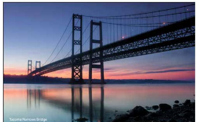
Tacoma Narrows Bridge

VictoriaVenturella@centralpurposetherapy.com