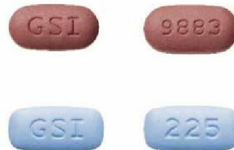
Authentic Biktarvy tablets are purplish-brown, capsule-shaped pills with "9883" on one side and GSI on the other, Authentic Descovy tablets are blue and rectangular shaped with "225" on one side and GSI on the other.

Counterfeiters used authentic, but often empty or near-empty, bottles that once contained its HIV medications.